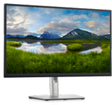
Dell 27 Monitor - P2723D

Stay focused on a 27-inch QHD monitor optimized to deliver high performance details and clarity.