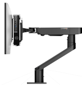
Dell Single Monitor Arm - MSA20

Easily mount your micro to select Dell E-Series monitors.