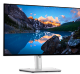
Dell UltraSharp 24 USB-C Hub Monitor - U2422HE

Stay focused on a 27-inch QHD monitor optimized to deliver high performance details and clarity.