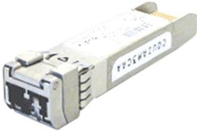
Figure 1. Cisco 10GBASE SFP+ modules

The Cisco® 10GBASE SFP+ modules (Figure 1) give you a wide variety of 10 Gigabit Ethernet connectivity options for data center, enterprise wiring closet, and service provider transport applications.