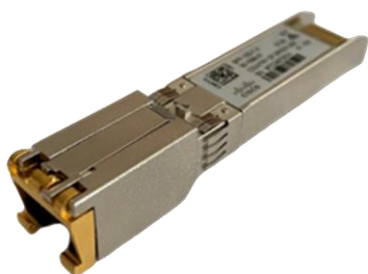
Figure 2. Cisco SFP+ 10GBASE-T module with RJ-45 connector

The Cisco 10GBASE-T module (Figure 2) offers connectivity options at the following data rates: 100M/1G/10Gbps. It has the SFP+ form factor and an RJ-45 interface so that CAT5e/CAT6A/CAT7 cables can be used to connect to end points with embedded 10GBASE-T ports. They are suitable for distances up to 30 meters and offers a cost-effective way to connect within racks and across adjacent racks.