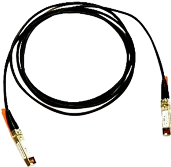
Figure 4. Cisco direct-attach twinax copper cable assembly with SFP+ connectors

Cisco SFP+ Copper Twinax (Figure 4) direct-attach cables are suitable for very short distances and offer a cost-effective way to connect within racks and across adjacent racks. Cisco offers passive Twinax cables in lengths of 1, 1.5, 2, 2.5, 3, 4 and 5 meters, and active Twinax cables in lengths of 7 and 10 meters.