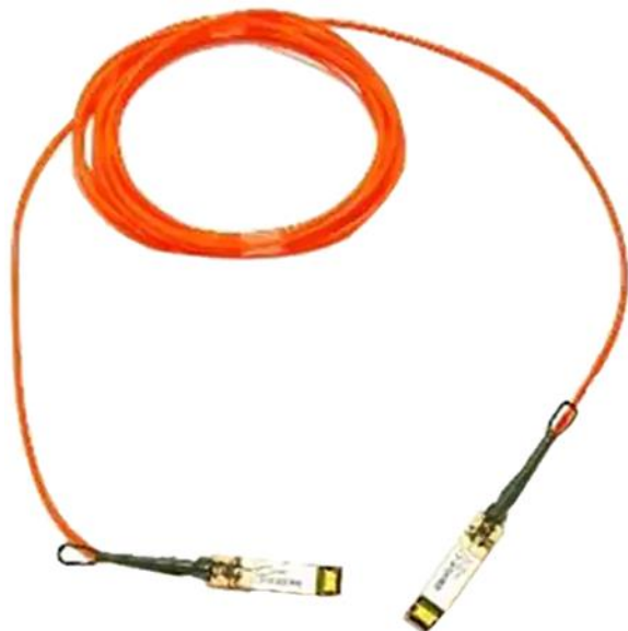
Figure 5. Cisco direct-attach active optical cables with SFP+ connectors

Cisco SFP+ Active Optical Cables (Figure 5) are direct-attach fiber assemblies with SFP+ connectors. They are suitable for very short distances and offer a cost-effective way to connect within racks and across adjacent racks. Cisco offers Active Optical Cables in lengths of 1, 2, 3, 5, 7, and 10 meters.