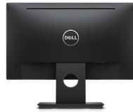
Back view - Cable management slot

Easily adjust the panel to your preferred viewing position.