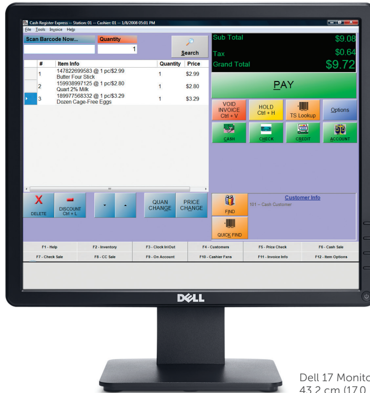
Dell 17 Monitor | E1715S 43.2 cm (17.0 inches)