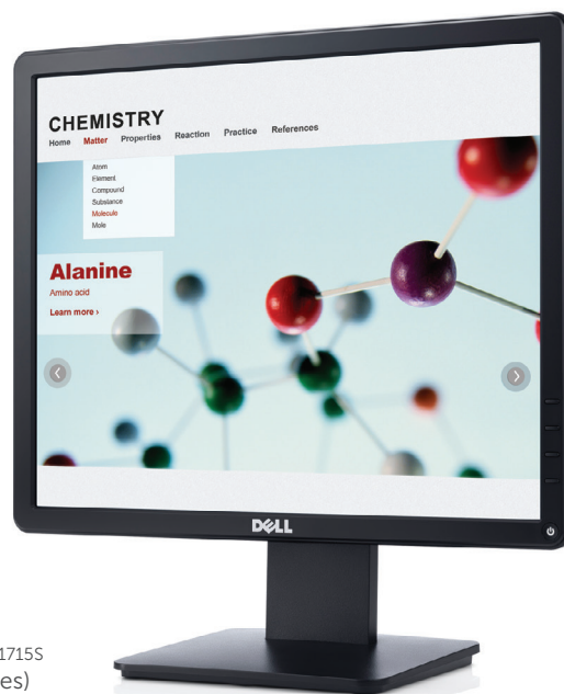
Dell 17 Monitor | E1715S 43.2 cm (17.0 inches)